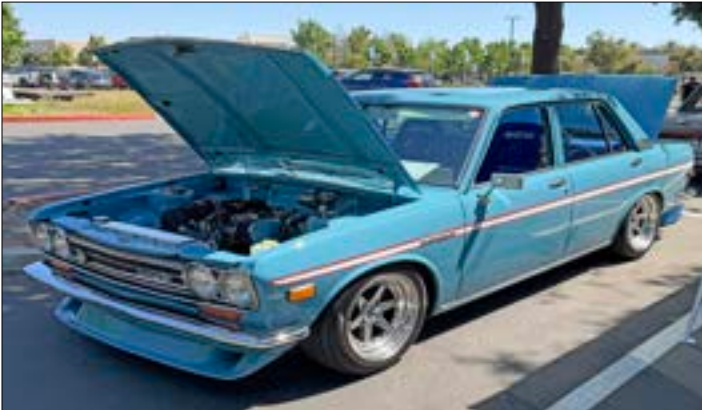
of the Datslocos Car Show on May 16, 2026