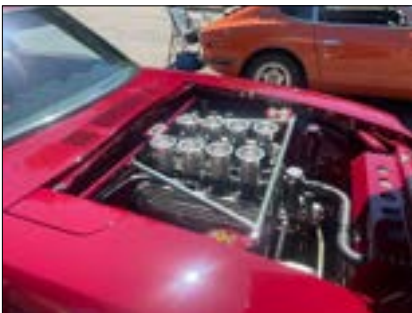
Blackhawk

We also gained 16 new to ZONC members just since May.