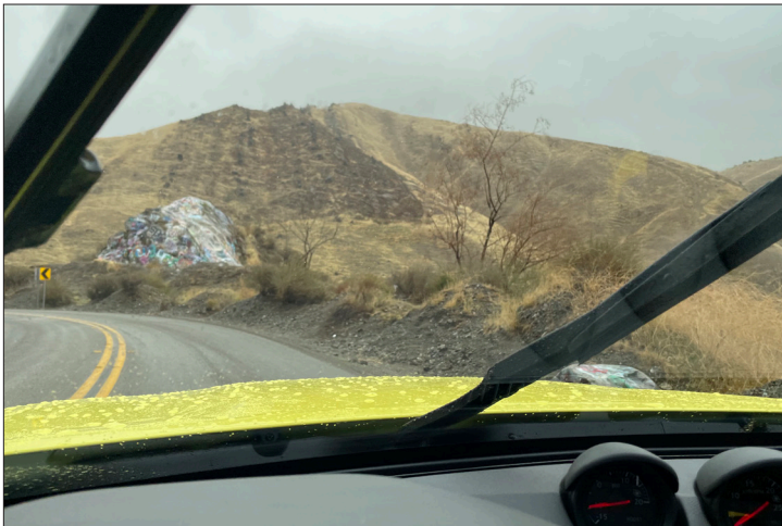
Another photo of the ZONCers attending the run.