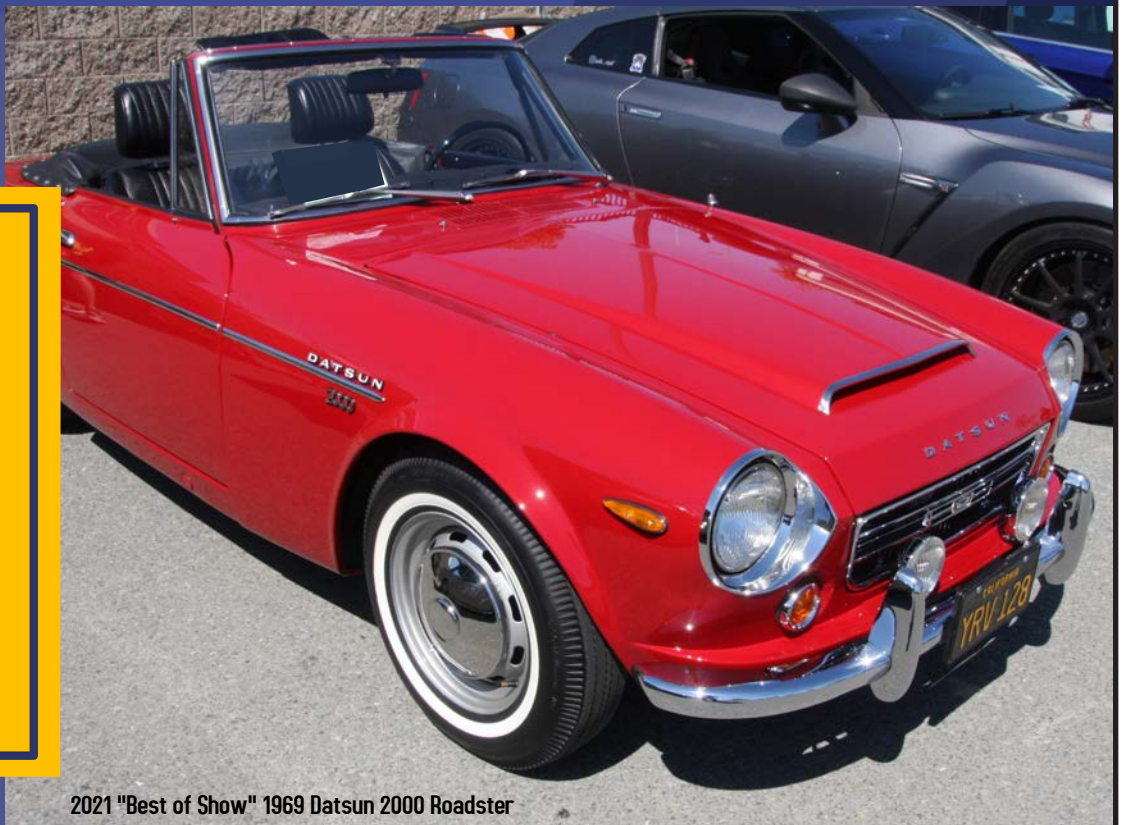
2021 "Best of Show" 1969 Datsun 2000 Roadster