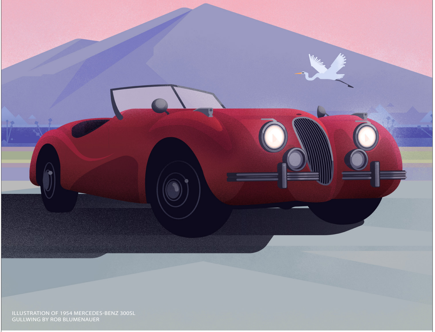
ILLUSTRATION OF 1954 MERCEDES-BENZ 300SL GULLWING BY ROB BLUMENAUER