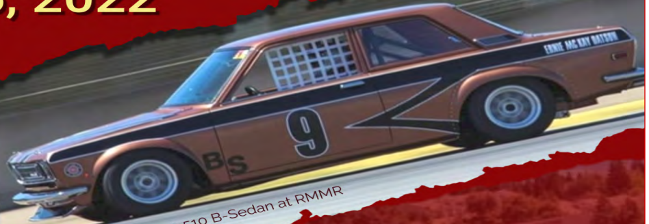
Troy Ermish #9 Datsun 510 B-Sedan at RMMR