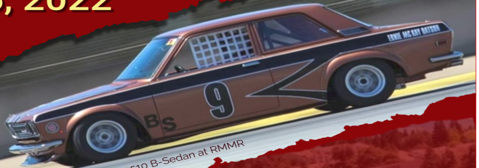
Troy Ermish #9 Datsun 510 B-Sedan at RMMR