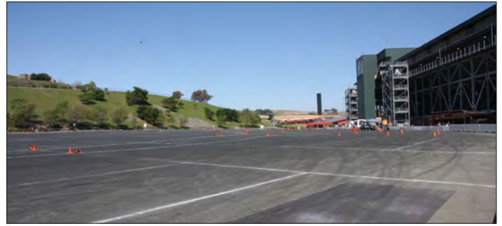
Autocross Area at Sonoma Raceway