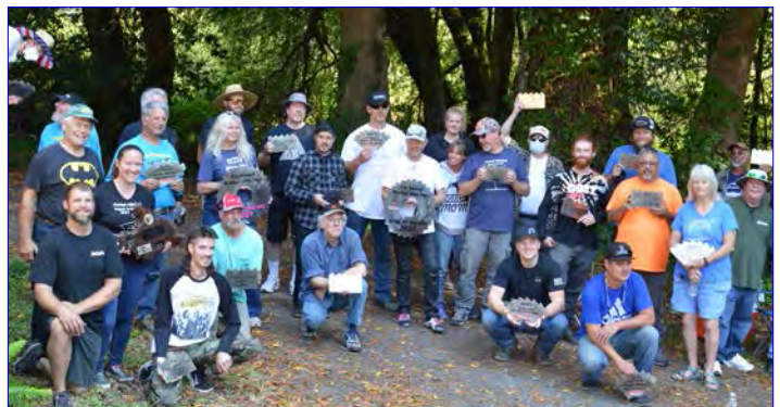
The 29 drivers who ran the hill.