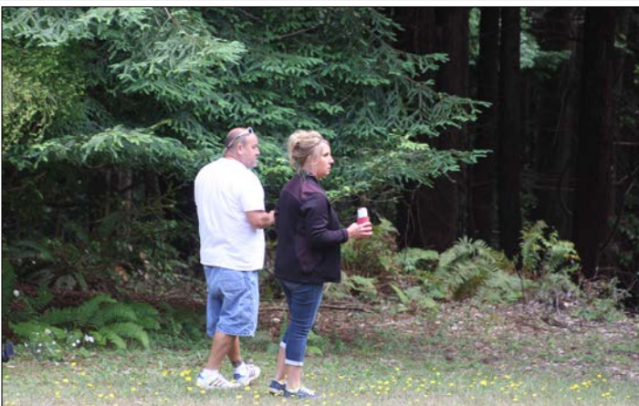
Off for a walk in the forest.