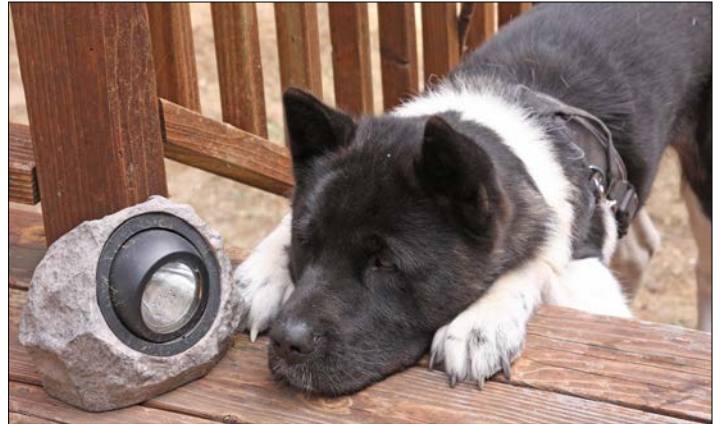
So sad puppy.