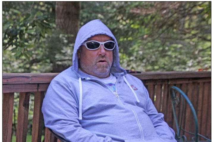
The sun went down and it got a little chilly.