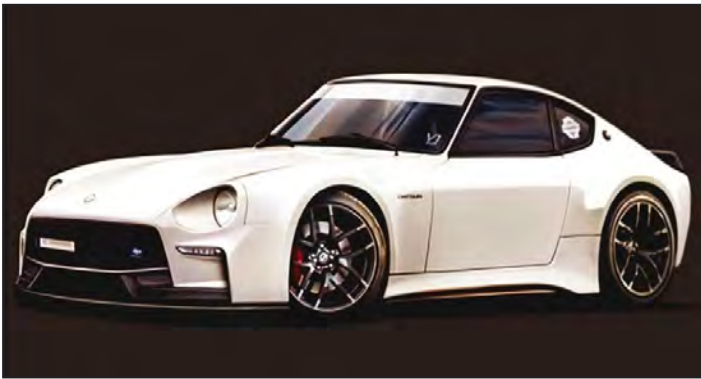
A Retro Z Car?