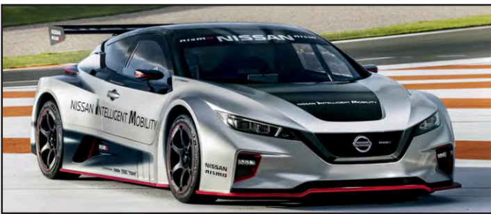
An Electric Z Car?