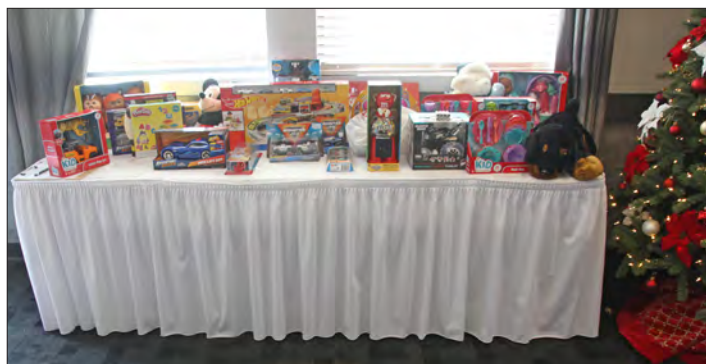
Toys for Kids Table