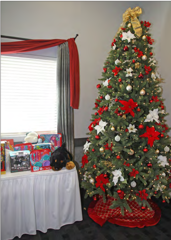
A nice Christmas Tree and Toys for Kids