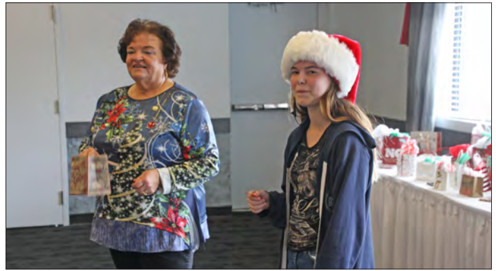
Handing out Raffle Prizes