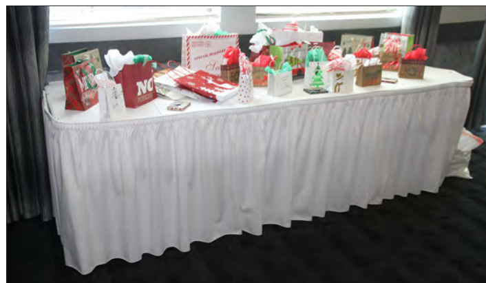
Raffle Prize Table