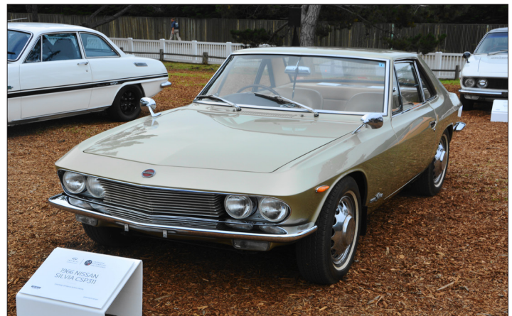
BEST OF SHOW: 1966 Nissan Silvia CSP311