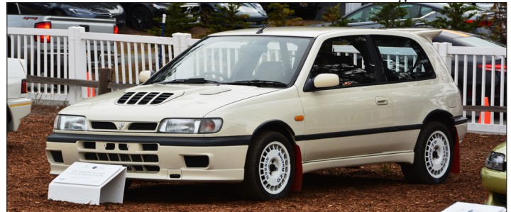
1992 Nissan Pulsar GTI-R Nismo edition