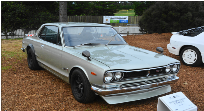
1971 Nissan Skyline C10 GT-R