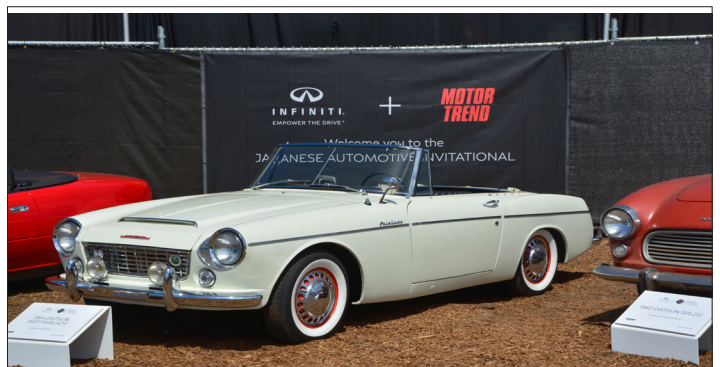
1964 Datsun 1500 Fairlady Roadster