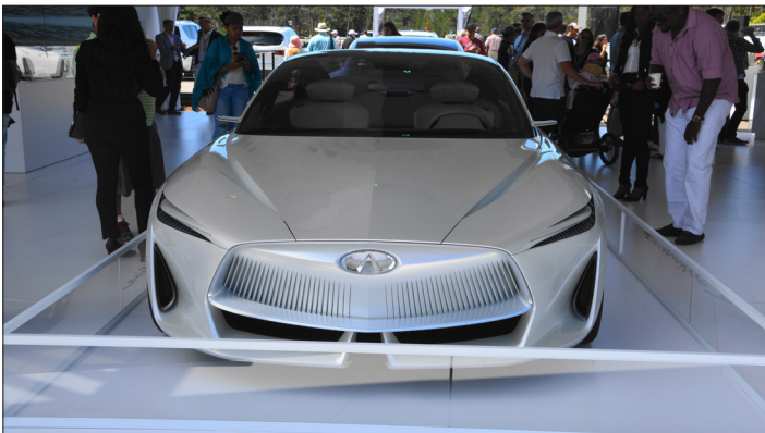
Q Inspiration has a luxurious presence