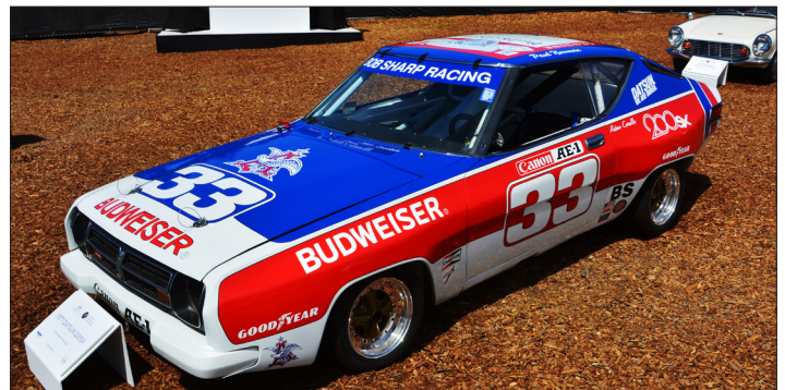
1977 Datsun 200SX Adam Carolla's CarCast