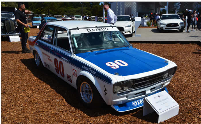
1969 Datsun 510, Adam Carolla's CarCast