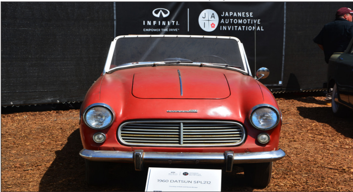
1960 Datsun SPL 212