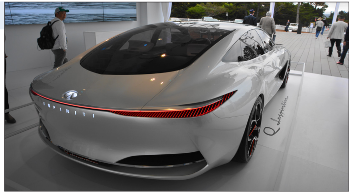
Q Inspiration's message: The future is electric.

The second annual Japanese Automotive Invitational, a Japanese automotive concourse on Peter Hay Hill at Pebble Beach, was hosted by Infiniti and showcased exemplary models of Japanese sports cars including Datsun and Nissan. The Infiniti pavilion and JAI were open and free to the public over the weekend. Almost everyone going to the Pebble Beach Concours d'Elegance was funneled through the Invitational and Infiniti's pavilion displaying its Q Inspiration concept cars. Here are some of the exhibited Datsun, Nissan and Infiniti cars: