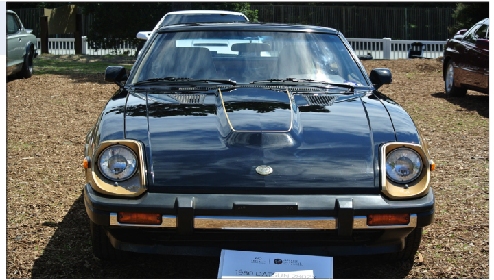
1980 Datsun 280ZX Nissan North American Heritage Collection