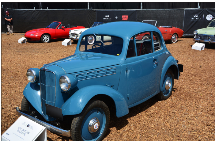
1937 Datsun 16 Coupe. Nissan Zama Heritage Collection