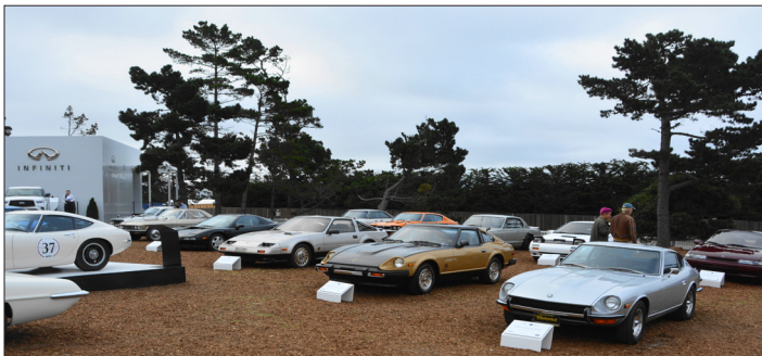
Japanese Automotive Invitational 2019 was hosted by Infiniti