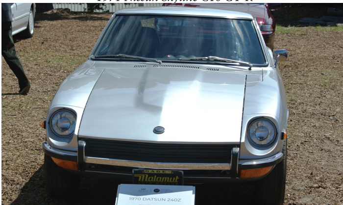
1970 Datsun 240Z