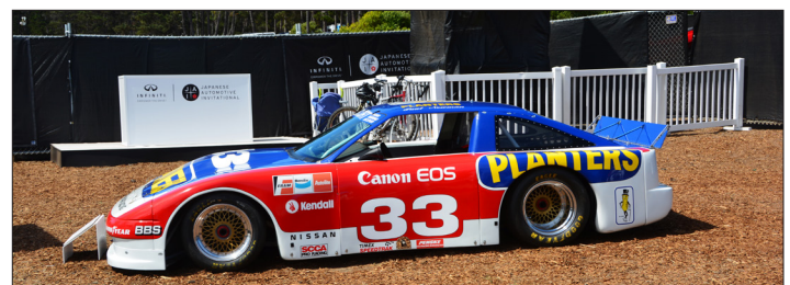
1988 300ZX, Adam Carolla's CarCast