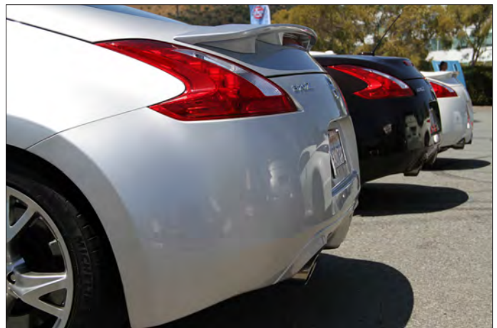
from the 2019 ZONC Car Show