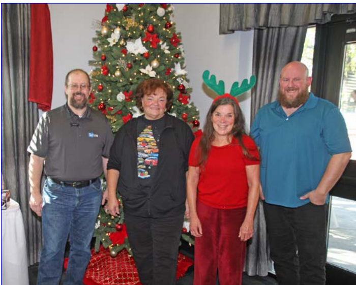
2019 ZONC Board