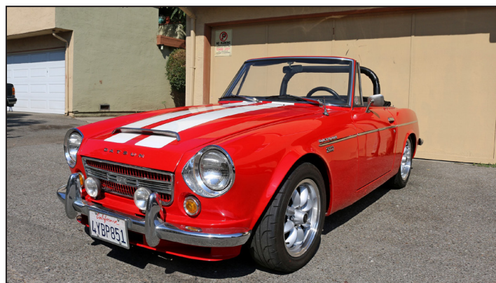
1968 Datsun 2000 SRL311.