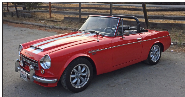
Shot taken at Alpine Inn Beer Garden, Portola Valley

This SRL-311 then appeared on Bring A Trailer and I