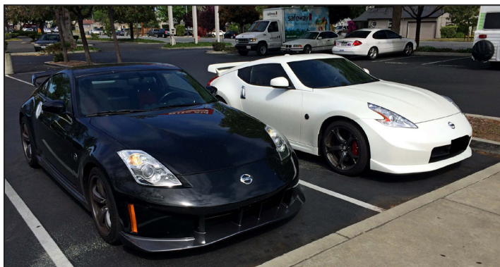
2008 350Z Nismo and 2012 370Z Nismo (in rare single picture together).

During those “professional years”, I only owned one Nissan product, an Infiniti Q45, along with a few Euro cars that were large enough to get my kids to school and sports practice.