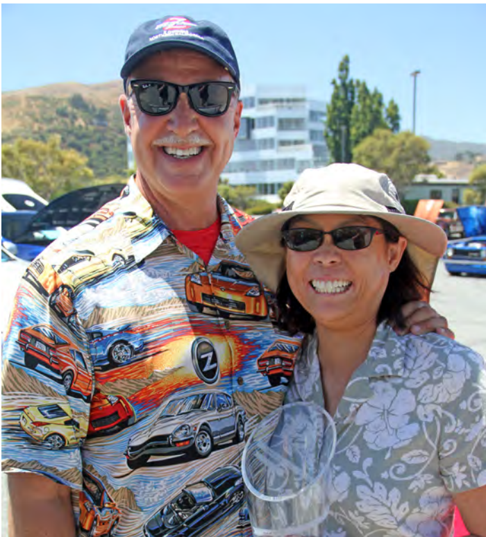
Best of Show Award Winner