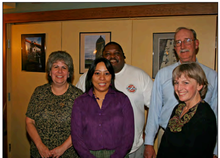
2007 ZONC Christmas Party