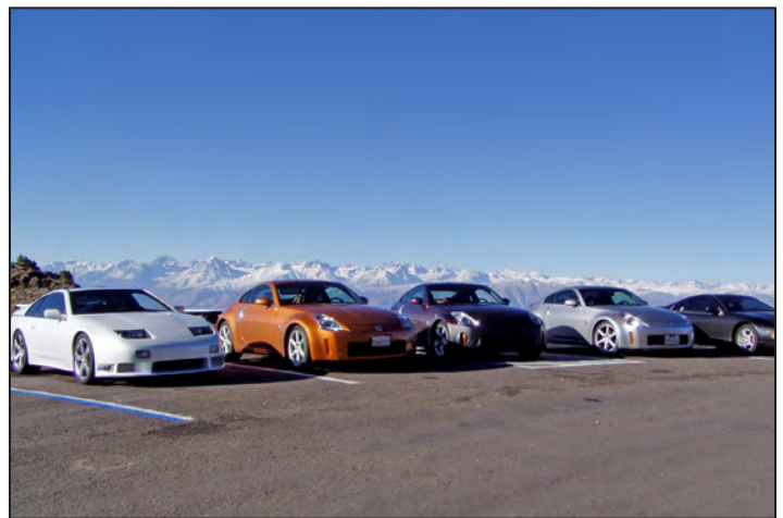
2007 Death Valley Run