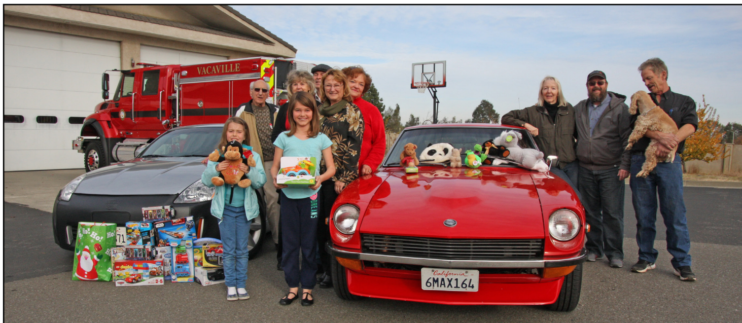
ZONCers deliver toys to Vacaville Fire Station

The Official Newsletter of Z Owners of Northern California