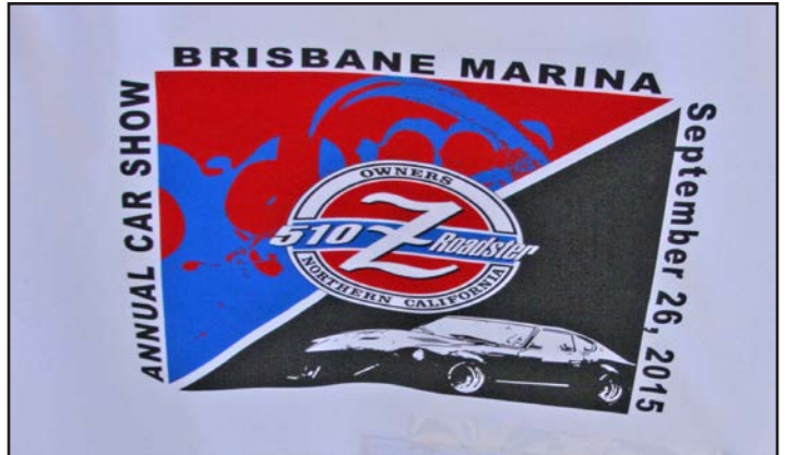
2015 ZONC Car Show Event T-Shirt