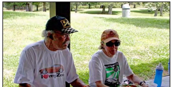
More ZONCers at the Annual Picnic

If you're not listed - it's because the Data Base Manager does not have your month of birth. And you're wished a Happy Birthday!