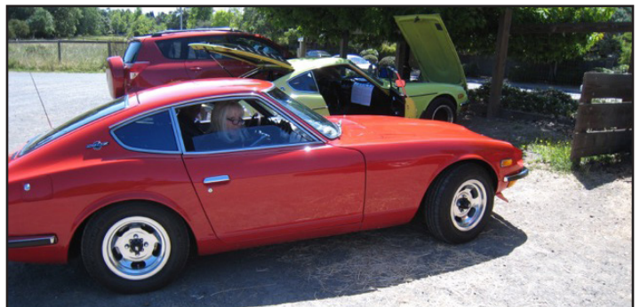
Rest Stop