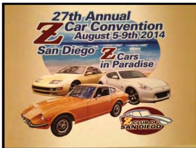
Flyer from ZCSD April 2014 Newsletter