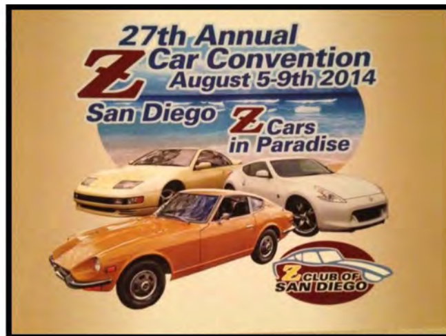
Flyer from ZCSD April 2014 Newsletter