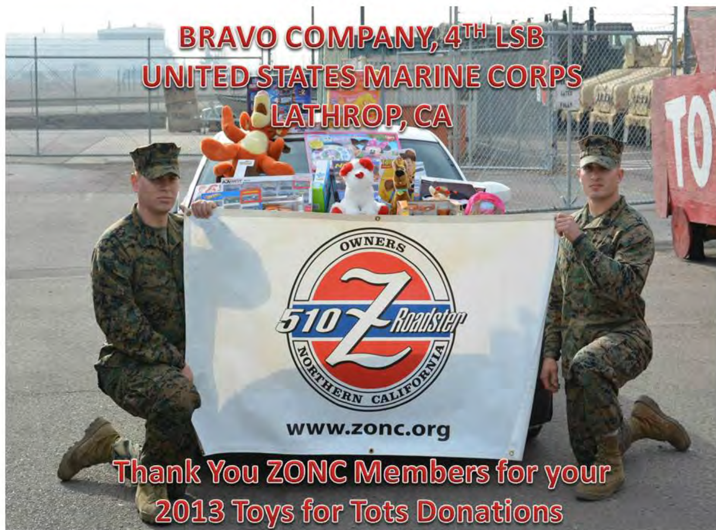
See more on page 9

The Official Newsletter of Z Owners of Northern California