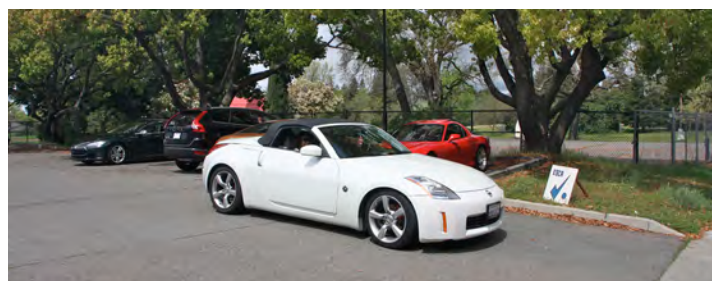
ZONCer at Rallye in 2013

The rallye has a web site where you can run a practice A/B Map Rallye and see the event flyer and pictures from past rallyes http://www.sonic.net/~thebeard/