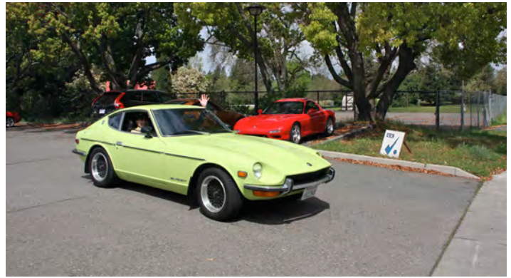
ZONCer at Rallye in 2013