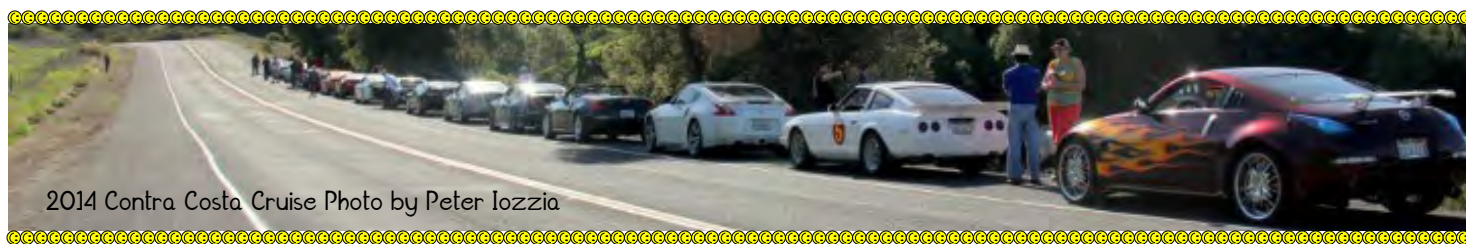
2014 Contra Costa Cruise