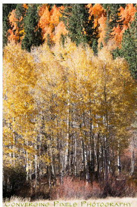
CONVERGING PIXELS PHOTOGRAPHY

Approaching the Pass area, the road becomes a very narrow two lanes. We stopped at Alpine Lake for pictures and then proceeded past Mosquito Lake and into the pass itself. After the Pass, the road becomes very twisty as we descended. All along this portion of the run, the changing colors of Fall were beginning to break out. We passed through Markleeville and then the road became open enough for speed.