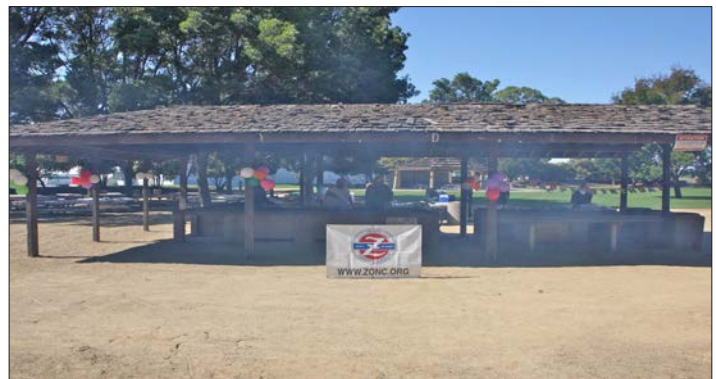
ZONC Picnic in Fairfield