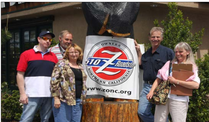
ZONC Board Meeting in Modesto