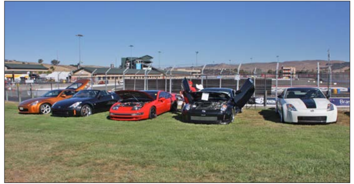
WTCC Races at Sonoma Raceway