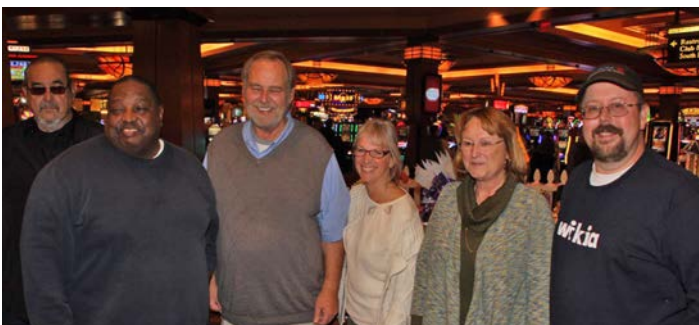
Banquet at Cache Creek in Brooks