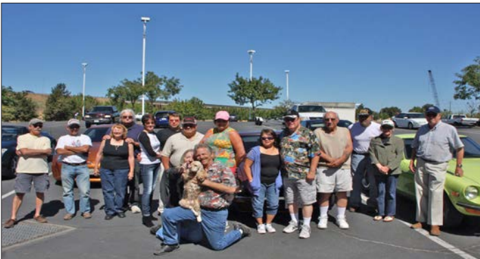
Drakes Beach Tour start in Petaluma