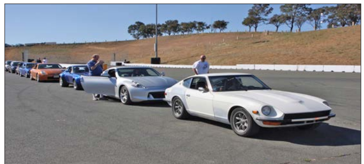
Sonoma Historics at Sonoma Raceway