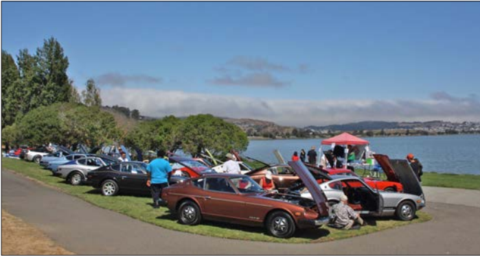
ZONC Car Show at Brisbane