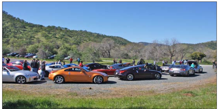
Rest Stop on Contra Costa Cruise